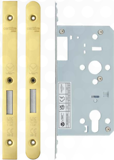
VDL0060-PVDG / VDL0060-R-PVDG