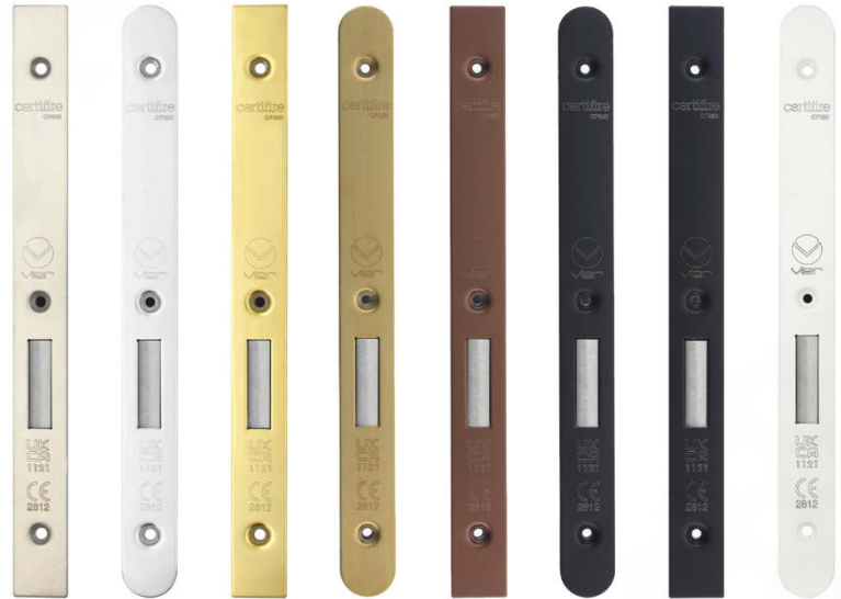
SSS PSS PVDG PVDB PVDBZ PVDBLK PCB PCW