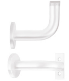
POWDER COATED WHITE