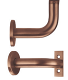
PVD SATIN BRONZE